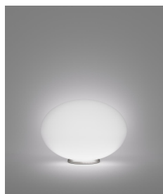
LUCCI LT G