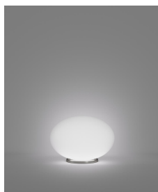
LUCCI LT P