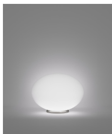
LUCCI LT M