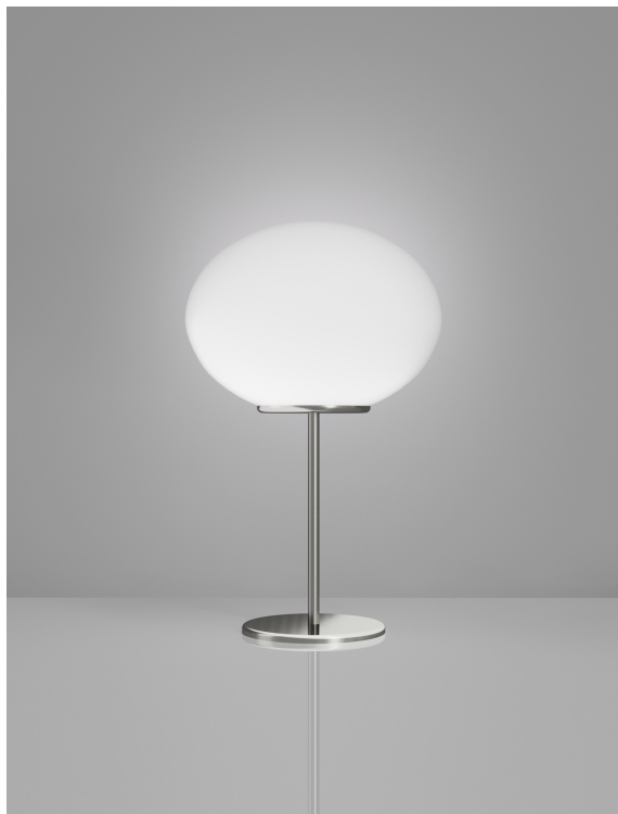
LUCCI LT 30 P BCST NI E27 CE